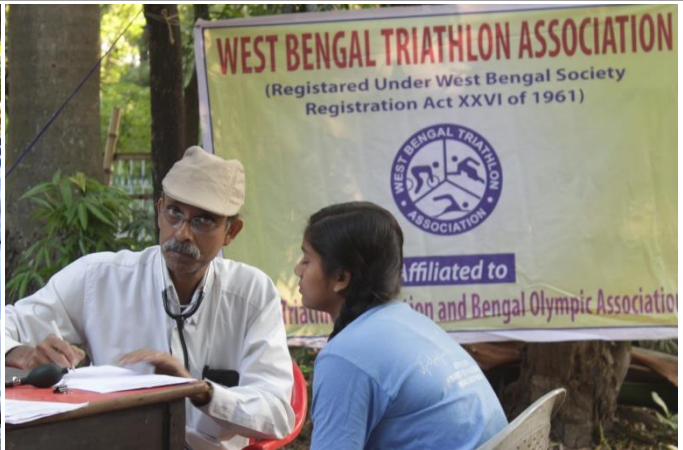
The Pre Event Medical Examination going on for the Participants