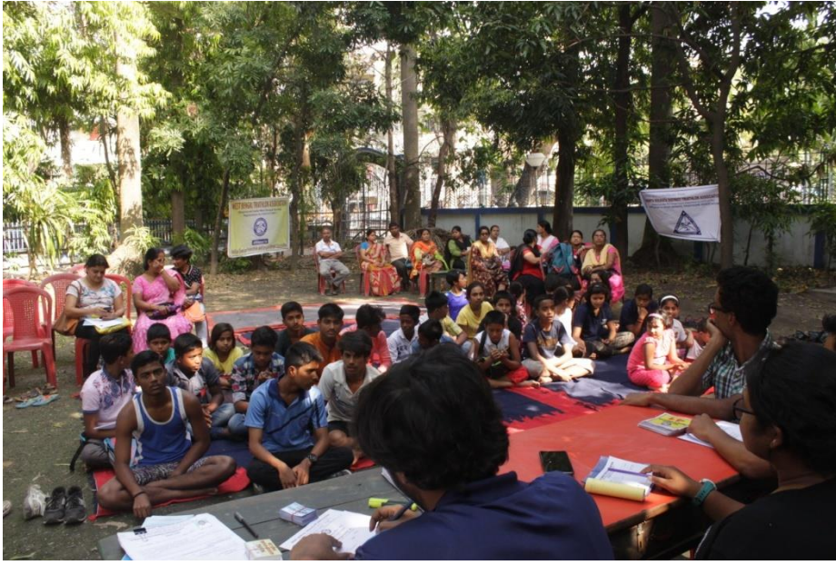
Gathering at the time of the Race Briefing