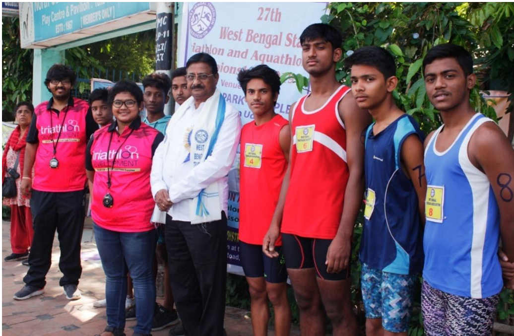
Boys Group I Participants were ready to take start