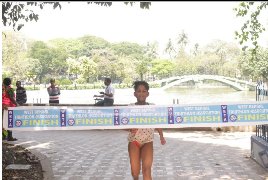
Girls Group III, First Position Participant at Finish Line