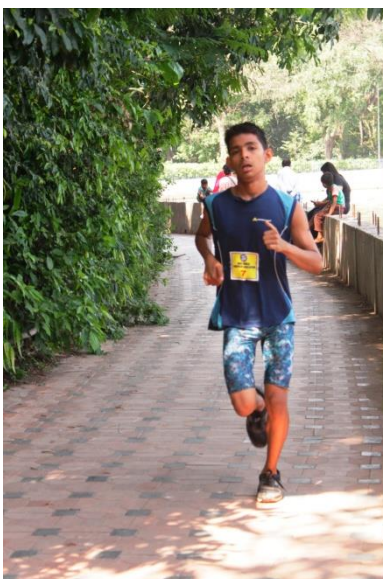
Participant in Running Part Of the event