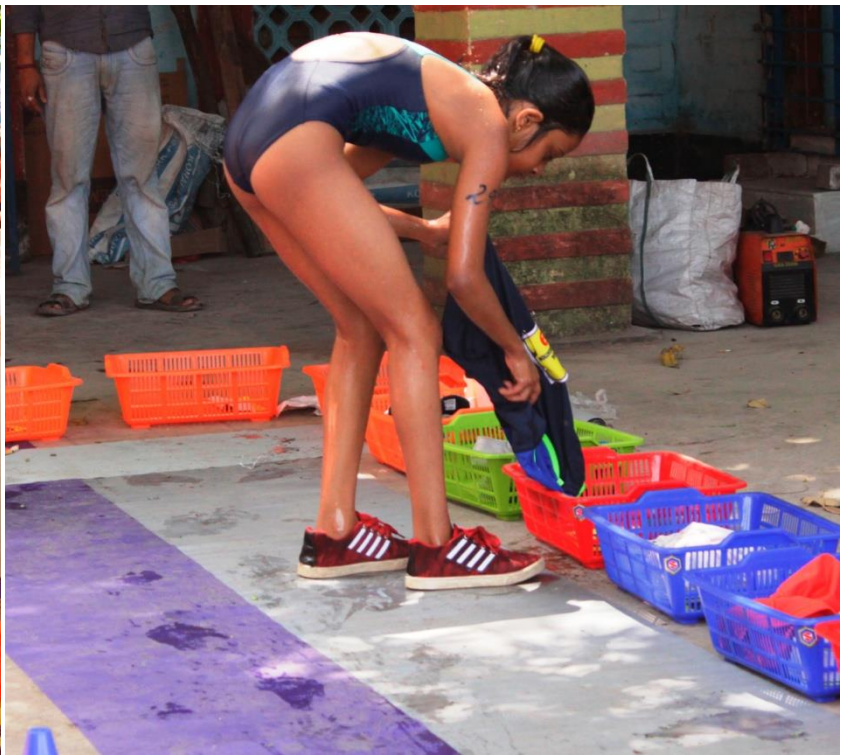
Participants at Transition Zone